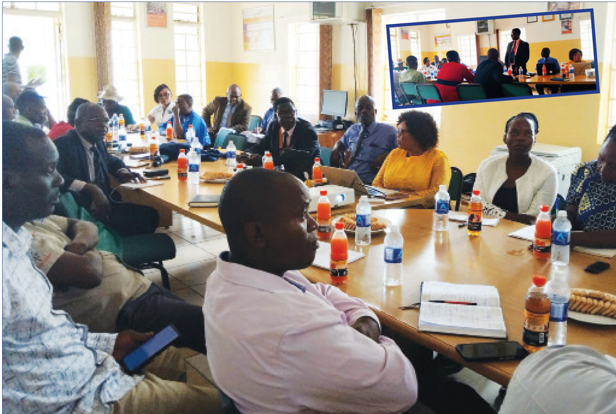
Images showing the proceedings of stakeholder meeting held in Lupane on 22 January 2025.