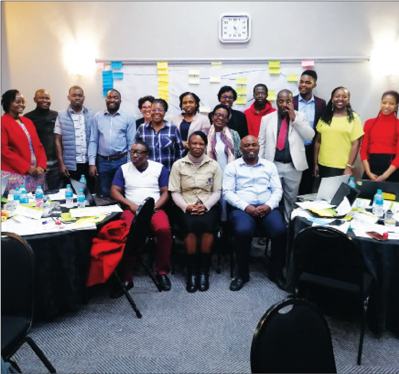
The team behind the project